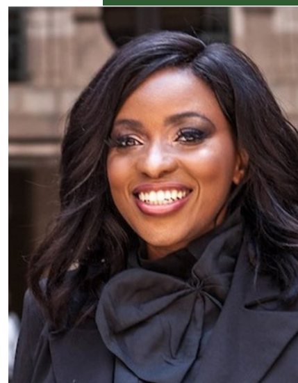
CONGRESSWOMAN JASMINE CROCKETT