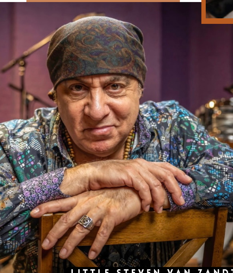
LITTLE STEVEN VAN ZANDT

We love deep dives with industry leaders, policy giants and influential luminaries shaping our culture. Drawing our listeners into the conversations, turning them on to new concepts and products and piquing their curiosity is what fuels the creative process of Planted. As policy works, cultivating voter engagement is also an important goal, as is approaching cannabis through a bipartisan lens.