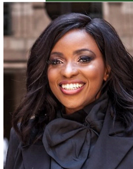
CONGRESSWOMAN JASMINE CROCKETT