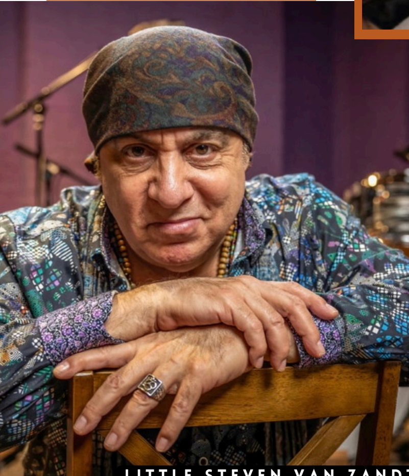
LITTLE STEVEN VAN ZANDT

We love deep dives with industry leaders, policy giants and influential luminaries shaping our culture. Drawing our listeners into the conversations, turning them on to new concepts and products and piquing their curiosity is what fuels the creative process of Planted. As policy works, cultivating voter engagement is also an important goal, as is approaching cannabis through a bipartisan lens.